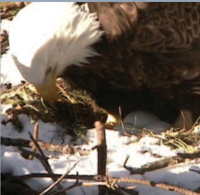
EagleCam 2011-02-11 08:56:44 Laying third egg