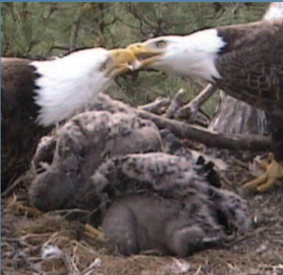
EagleCam 2011-04-15 16:20:33 Eagle family