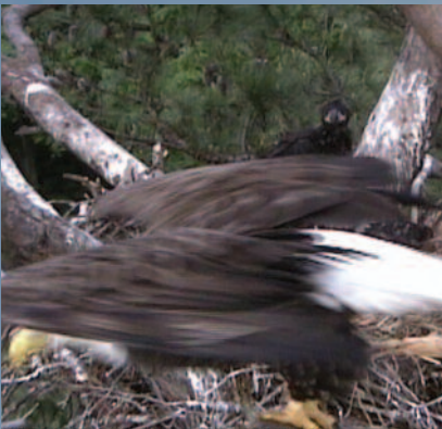
EagleCam 2011-04-26 08:03:39 Mother's final morning with eaglets