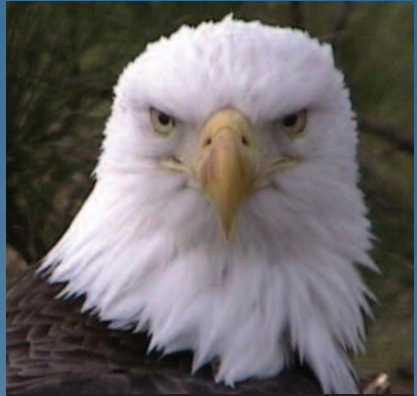
EagleCam 2011-02-03 11:40:16 Female