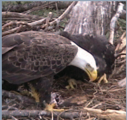
EagleCam 2011-04-26 18:56:12 Dad's final evening with eaglets