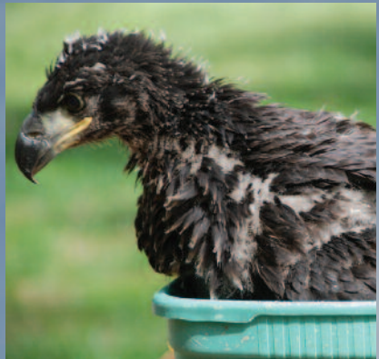
April 21, 2011 Banding