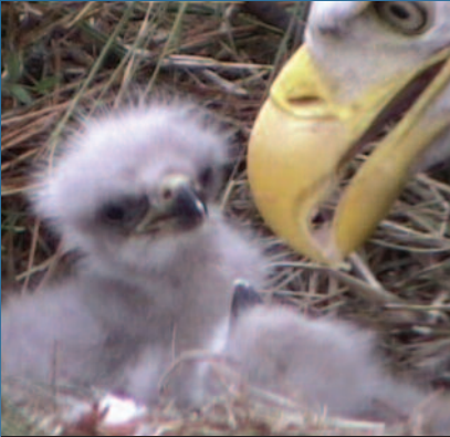
EagleCam 2011-03-18 09:17:43 Second eaglet