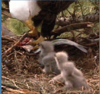
EagleCam 2011-03-22 14:05:26 Three eaglets