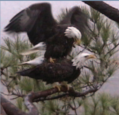
EagleCam 2011-01-18 08:18:54 Eagles mating