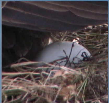
EagleCam 2011-02-03 14:50:42 Laying first egg