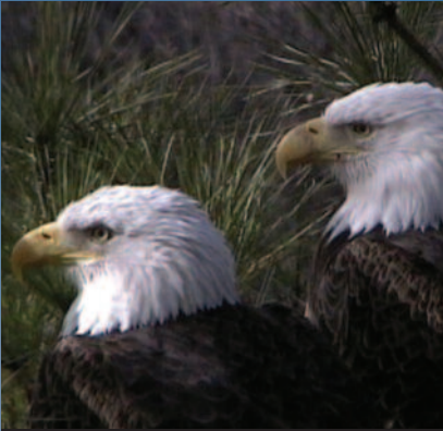
EagleCam 2011-01-25 10:44:59 Pair