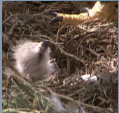
EagleCam 2011-03-13 13:51:25 First eaglet